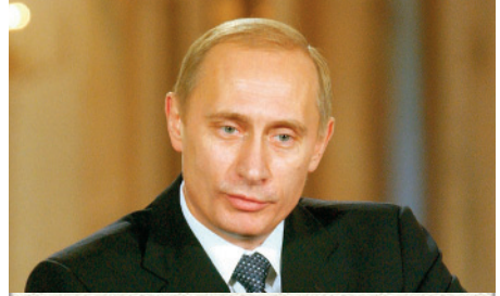
Vladimir Putin 1952–

Vladimir Putin worked for 15 years as an intelligence officer in the KGB (Committee for State Security). Six of those years were spent in East Germany. In 1990, at the age of 38, he retired from the KGB with the rank of lieutenant colonel.